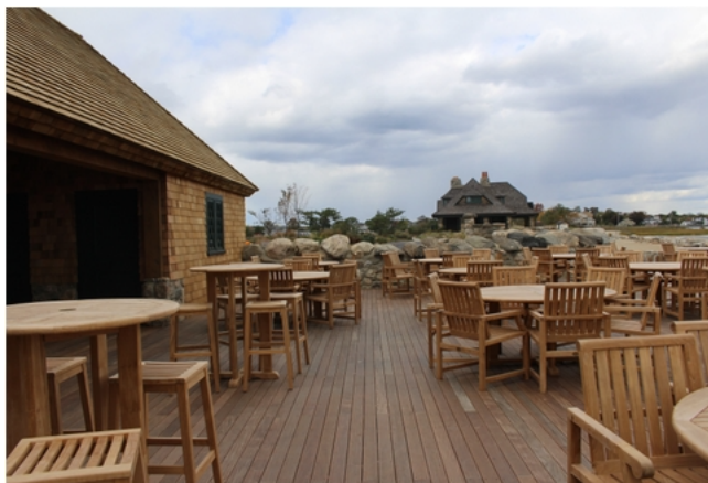
The Sue H. Baker Pavilion at the old barn.