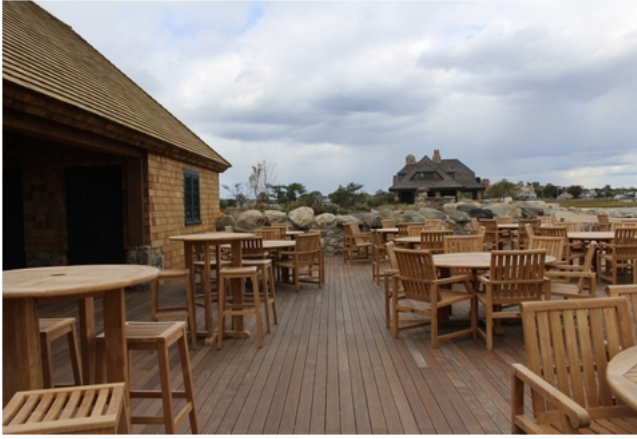
The Sue H. Baker Pavilion at the old barn.