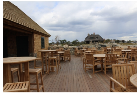
The Sue H. Baker Pavilion at the old barn.