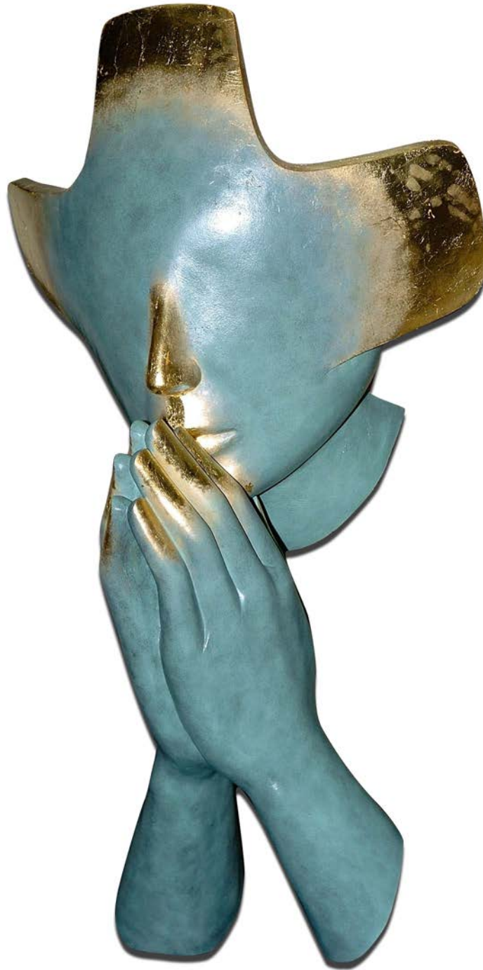
Praying Hands & Face Sculpture Statue, Cathédrale Notre-Dame, Reims, France.