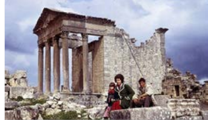
Roman ruins in Carthage, Tunisia

by "snail mail" they were married in November 1961 in Tunisia and settled in Algeria in 1962.