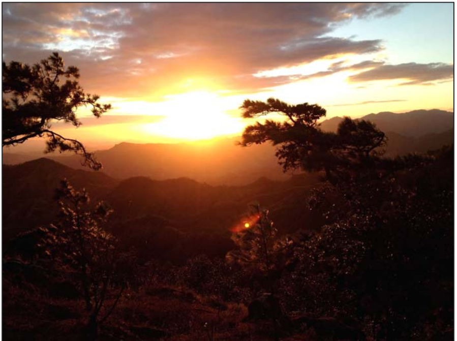
Sunset from the Mirador in Nicaragua