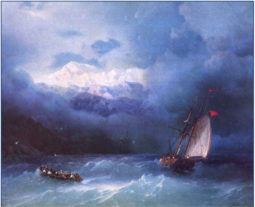
Stormy Sea by Ivan Constantinovich Aivazovsky, 19th century